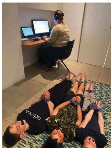
Working from home.